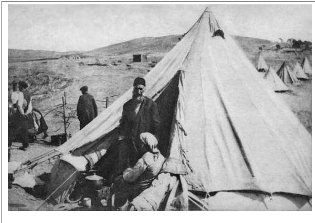
Jewish Refugees living in tents after the Fire

antiquated equipment. To complicate matters, the fire started on a Saturday, the Jewish Sabbath and the Jewish firefighters could not respond immediately. Salonika was constantly plagued by fire, as were most cities in the Ottoman Empire, overcrowded with wooden structures. Major fires in the 1890s and in 1910 had nearly devastated portions of the town, but the fire of 1917 was, by far, the most destructive fire in the history of the city.