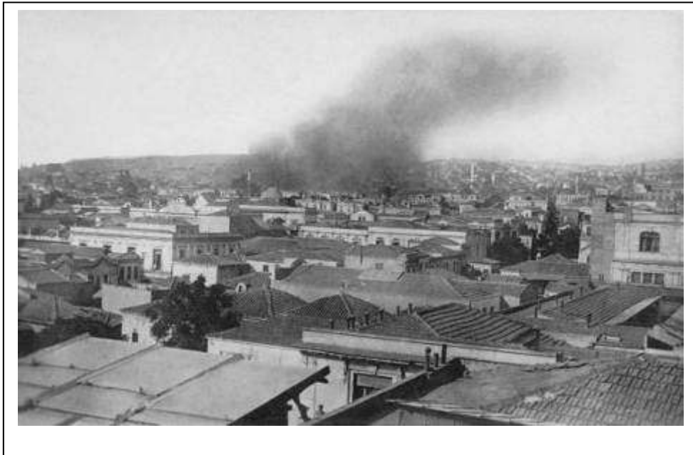
Aerial View of Thessaloniki and Fire of August 18, 1917

August 18, 1917 marks the 95 th anniversary of the Great Fire in Thessaloniki (Salonika). The central portion of the city actually destroyed by the fire was only about a mile and a quarter in length and a little over half a mile in width but the general loss was so immeasurable as to defy all imagination. The fire had started on a Saturday afternoon in a little wooden house in the upper part of the city, as a refugee was frying eggplant and the pan turned over. A simple start to what would become a devastating destruction, not only of physical structures but, also, of human lives. While few would be killed by the fire (only a group of drunken French soldiers were burned alive in a wine-shop), 49% of the total population of the city was left homeless, the greater majority of them, Jews.