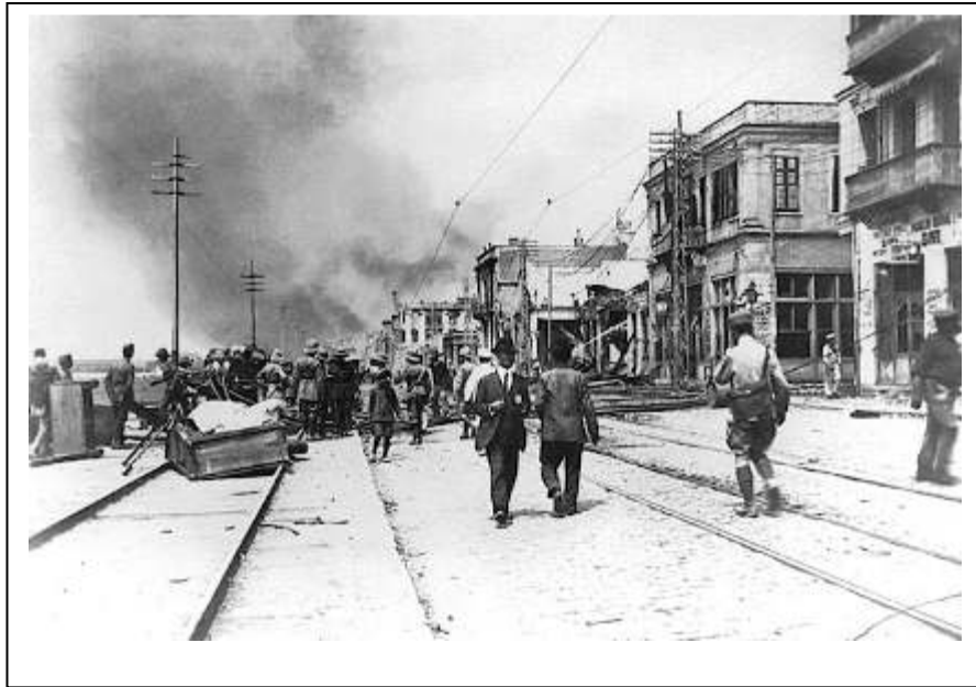
The port in the wake of the Fire

threw their goods out onto the streets, calling desperately for hamales (porters) to help them. By midnight of the 18 th , the harbor was filled with refugees, clutching the remnants of their shattered lives. The fire would continue to burn for several more days and it was immediately apparent that the destruction had reached gigantic proportions. The Jewish community of Salonika would never recover.