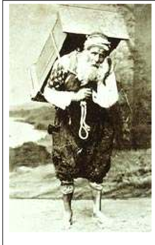
Jewish porter in Salonika